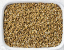
LENTILS (can be used as base)