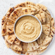
HUMMUS WITH PITA