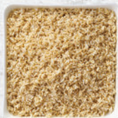
BROWN RICE PILAF