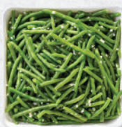
GARLIC GREEN BEANS