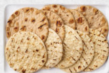
PITAS WHITE OR WHEAT