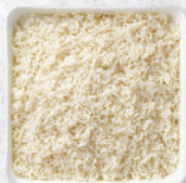
LEMON RICE PILAF