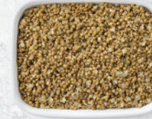
LENTILS (can be used as base)