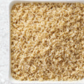
BROWN RICE PILAF