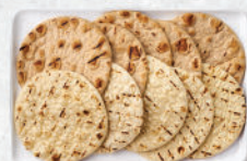
PITAS WHITE OR WHEAT $11.00