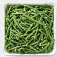
GARLIC GREEN BEANS