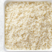
LEMON RICE PILAF