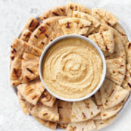
HUMMUS WITH PITA